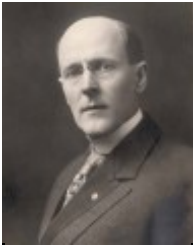
Paul Harris Founder of Rotary